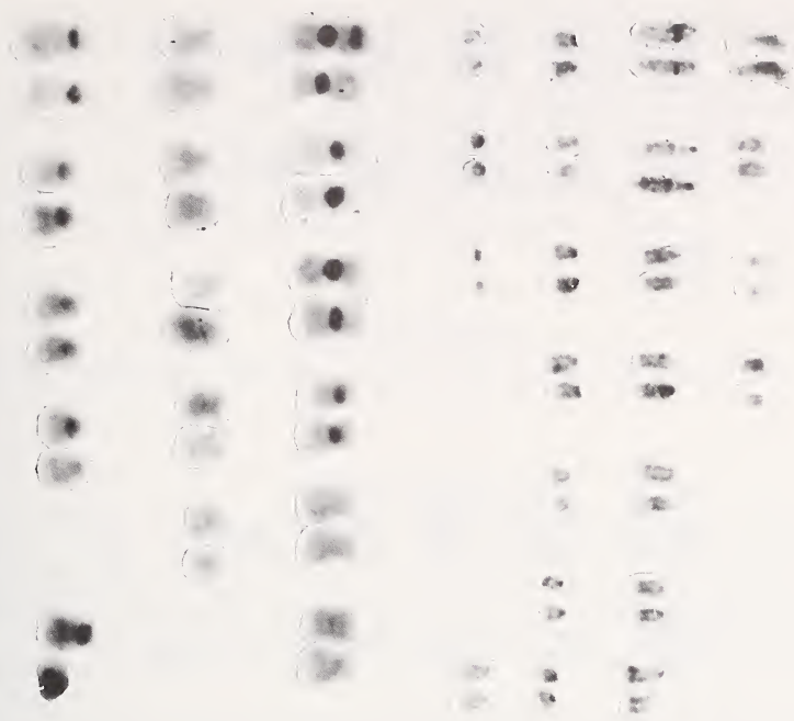
Fig. 1: C-banding. Karyotypes of a) S. strandi , female from Stavropol region, Sergievka area ( 2n = 44 , NF = 52 ); b) S. betulina , male from Eastern Carpathians, Goverla mountain area ( 2n = 32 , NF = 64 ).

At present, karyotype morphology is one of the main diagnostic characters for S. severtzovi and its similar congener S. subtilis . The karyotypes of both species also differ by the NOR localization (fig. 2a, b). In the chromosome set of S. s. nordmanni the NOR is located at the terminal parts of the short arms of the ninth (submetacentric) pair of autosomes, while in S. severtzovi these structures are in the secondary constrictions of the largest pair of acrocentrics.